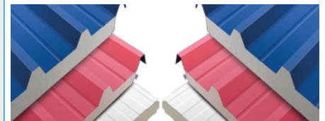
Sandwiched (Insulated) Panels

Insulated Sandwich Panel is extensively used in construction industry and are made with three separated elements. These are a versatile construction material that offers thermal & acoustic insulation properties in order to enhance design and engineering properties. Our range of panels provide superior insulation, are very light in weight, fire-resistant and extremely durable. Offering simple and easy-to-erect solutions, these panels are widely used demanded by Pharma, Electronics, Precision machining, Paint shops.